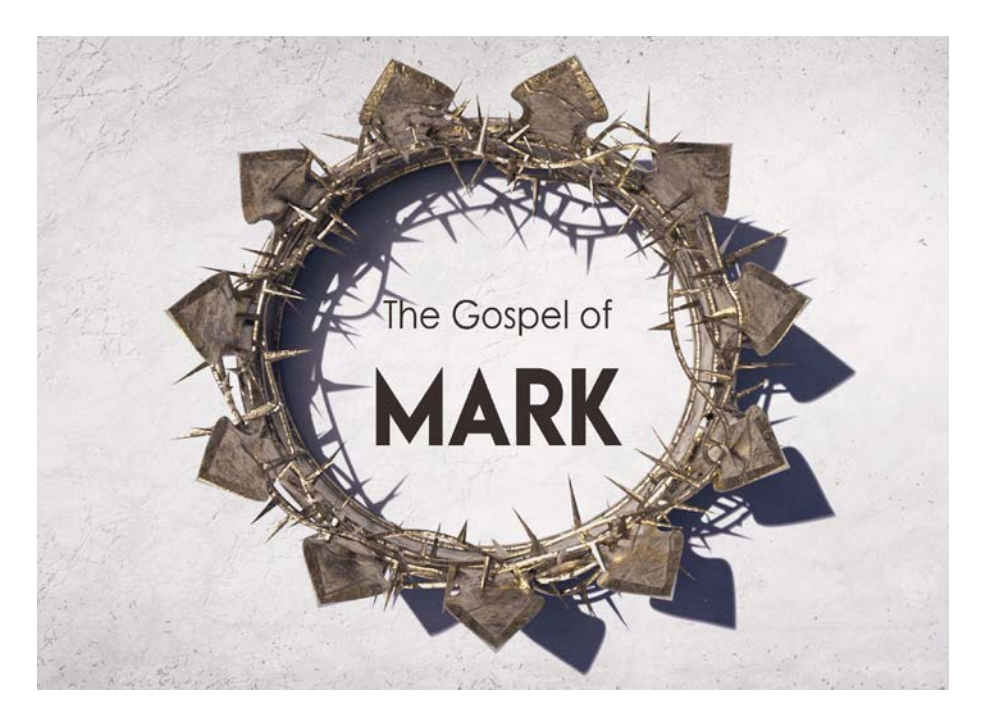
Lesson 2 – Mark 1:9-13